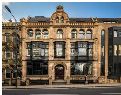
Leeds 10-12 East Parade Leeds LS1 2BH