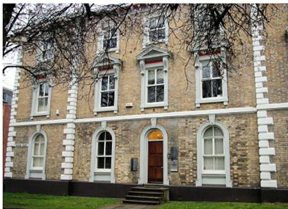
Leicester 5 Museum Square Leicester LE1 6UF