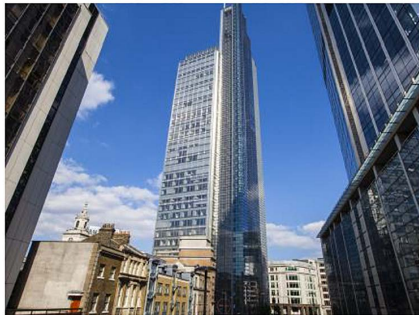
London (City) 110 Bishopsgate London EC2N 4AY

Supporting you, our offices and lawyers nationwide: