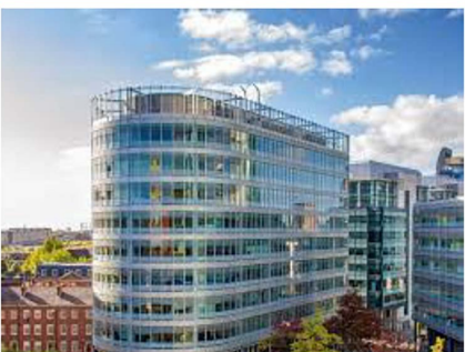
Manchester 3 Hardman Square Manchester M3 3EB