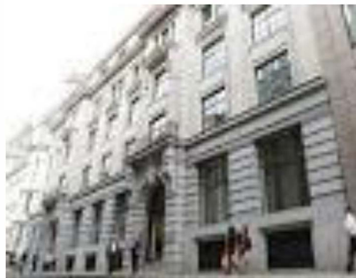
London (Central) 5 Chancery Lane London WC2A 1LG