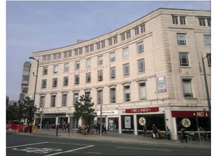
Liverpool 5 Derby Square Liverpool L2 9XX